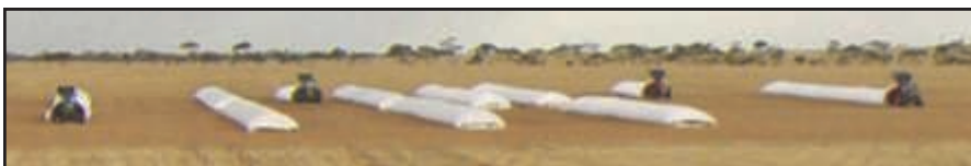
Silo bags being set up and filled at EP Storage Taragoro site

The much anticipated start of the EP Storage silo bag site, to complement the wheat bunkers at the Rudall site, has commenced in earnest. Whilst the general grain trade are yet to