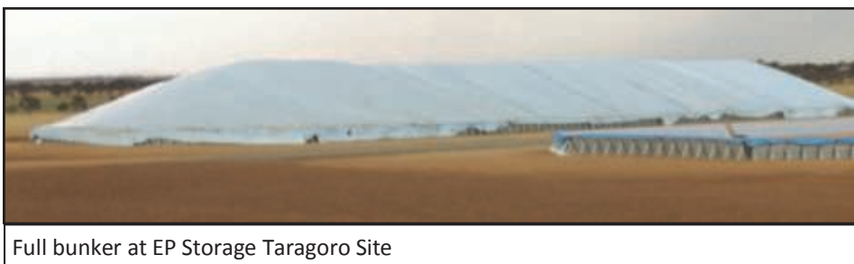
Full bunker at EP Storage Taragoro Site

It's fair to say that the team have had their share of 'learnings' from pulling together a major new business like EP Storage in such short time. New equipment has certainly provided challenges to the operations of the business, but the team, with incredible support from local